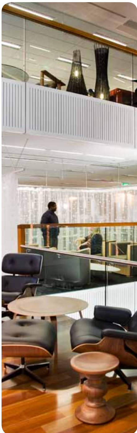
Santos Headquarters, Adelaide, GBC Australia

Costs of ill-health vary by sector and country, and are rarely comparable, but the impact is clear: