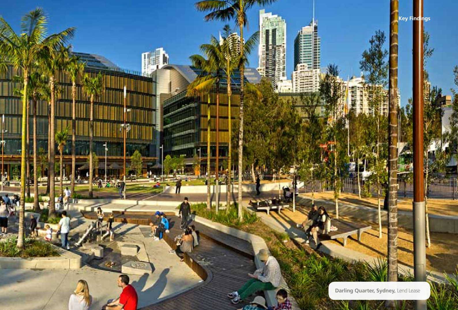
Darling Quarter, Sydney, Lend Lease

Noise: Being productive in the modern knowledge-based office is practically impossible when noise provides an unwanted distraction. This can be a major cause of dissatisfaction amongst occupants.