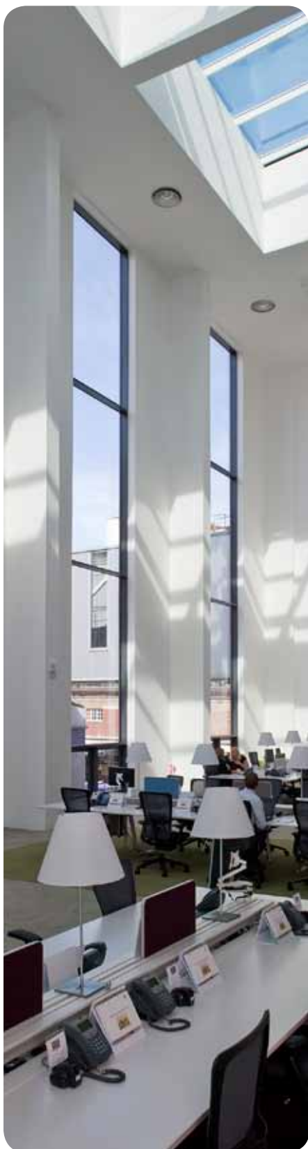
Bournville Place, Birmingham, Cundall